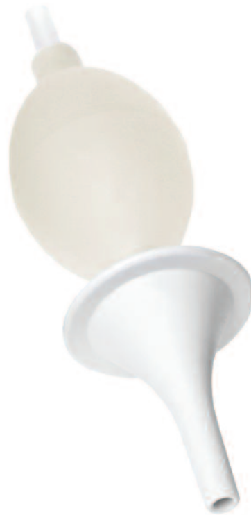
Device for washing out the rectal stump

If the mucus is quite sticky and difficult to pass, small enemas such as Microlax can be used. The enema liquid inside the back passage lubricates and softens the mucus. This helps to remove the plug and prevent straining. Again they take 10-15 minutes to work and are safe to be used on a regular basis. They are available on prescription and should only be used on the advice of a healthcare professional.